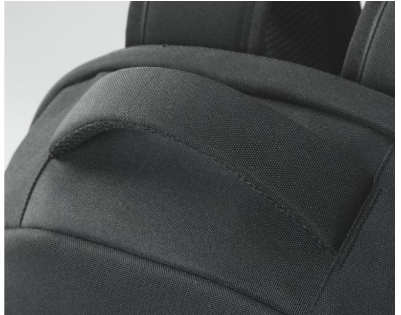
SOLID HANDLE AND STRAPS