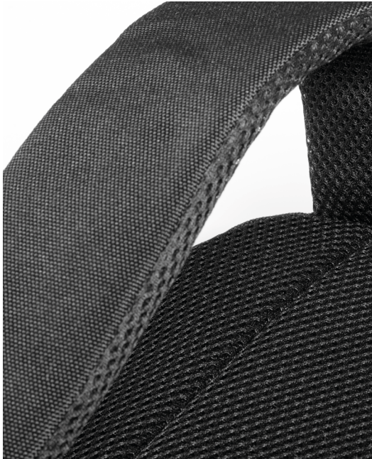
BREATHABLE BACK SYSTEM