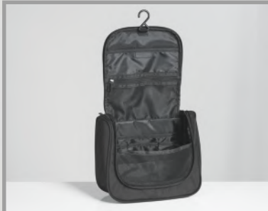
A SEWN-IN HOOK FOR CONVENIENCE