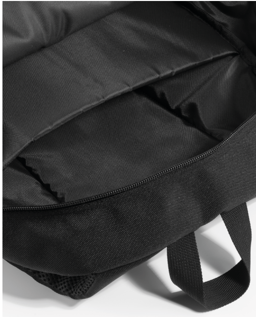
15" LAPTOP POCKET