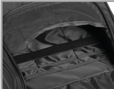
ROOMY MAIN COMPARTMENT