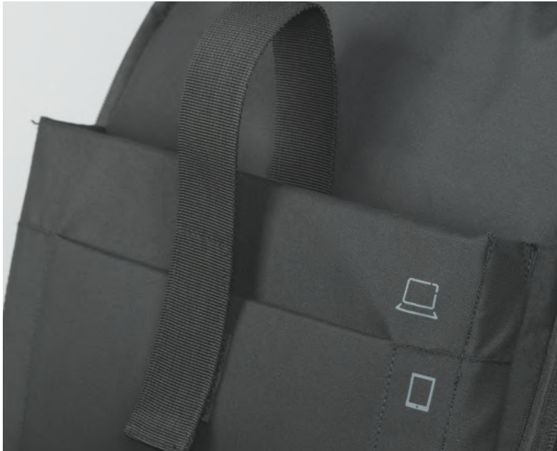
LAPTOP AND TABLET POCKETS