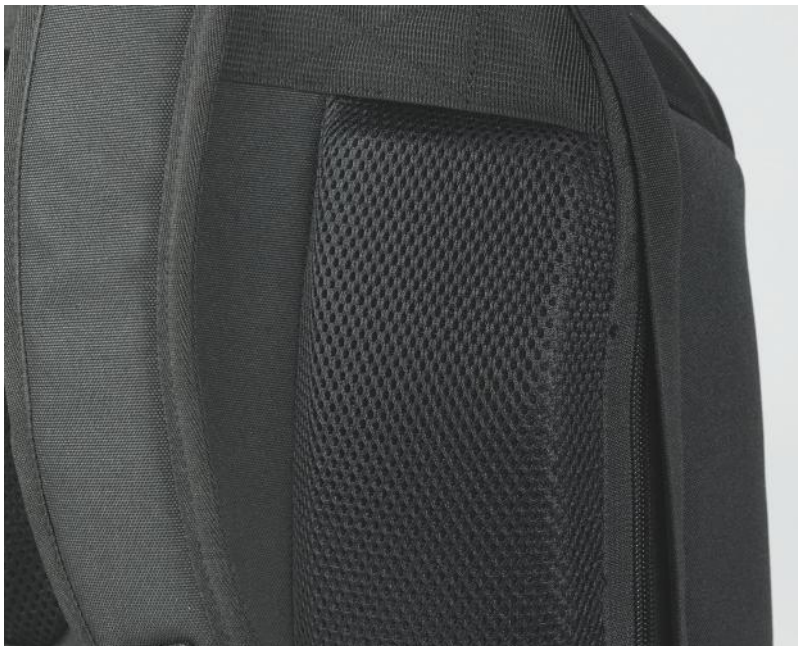
BREATHABLE BACK SYSTEM