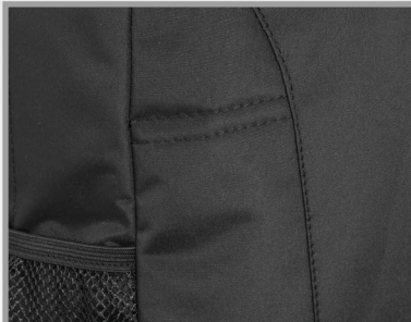
LIGHT AND DURABLE MICORFIBER