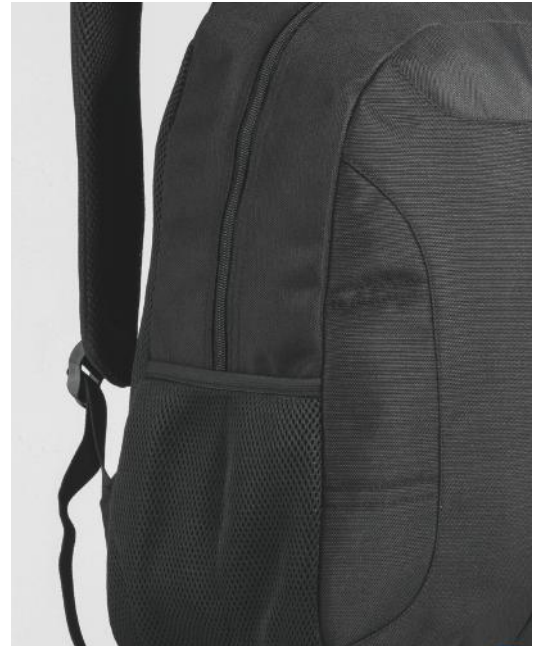
ADDITIONAL SIDE POCKETS